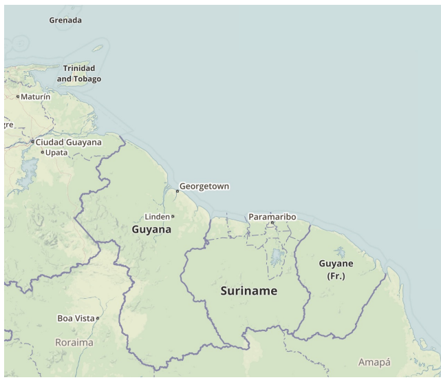
USGS (2020). [online] Available at: https://ngmdb.usgs.gov/topoview/viewer/#6/5.970/-58.788

TROVE Latin America North contains regional, field and discovery data for Trinidad & Tobago, Guyana, Suriname and French Guiana.